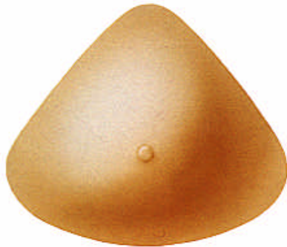
Symmetrical 3-wing shell